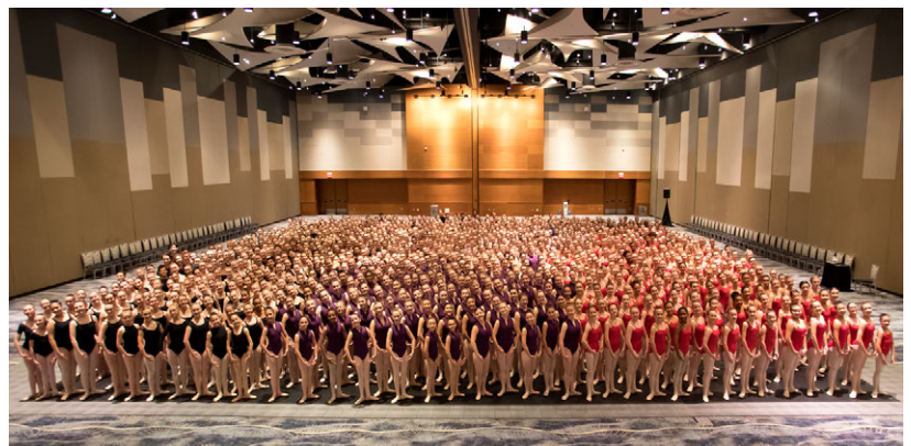
Dancers at the RDA National Festival in Phoenix, AZ.